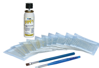
Splicer V-groove Cleaning Refill Kit